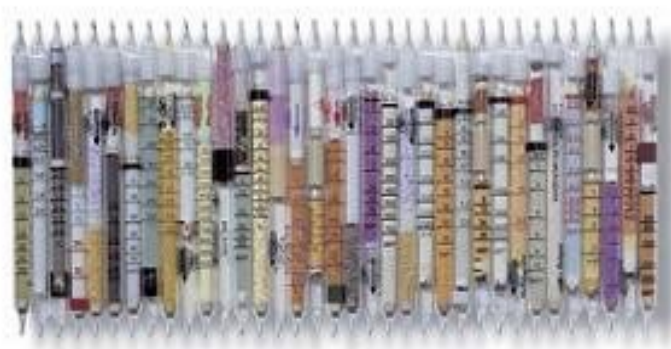
Gas Detection Tubes