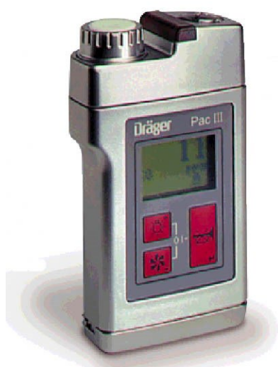
Portable Gas Monitor

Methanol vapor concentrations can be measured using direct-reading gas detection tubes, such as colorimetric detection tubes, or with electronic instruments, such as portable gas monitors. Gas monitors can provide continuous readings of methanol concentrations, and alarms can also be set at specified concentrations. TWA personal exposure concentrations can also be measured using an air sampling pump with silica gel sorbent tubes.